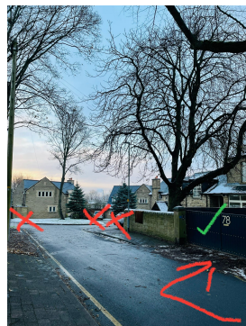
Norfolk Close turn in the first Gate (78) please do not park, turn or don't park on this road block the drives mark with a X