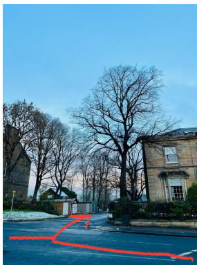
Turn Off New North Road A629