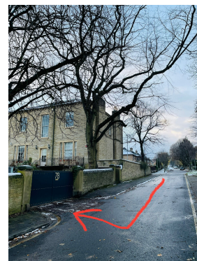
Norfolk Close please